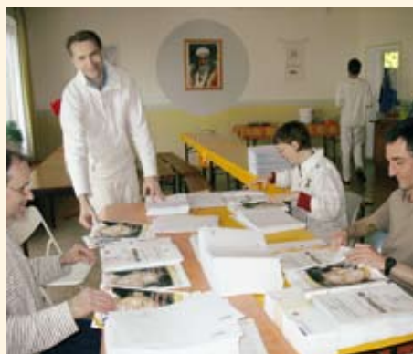
Selfless work for Hand in Hand